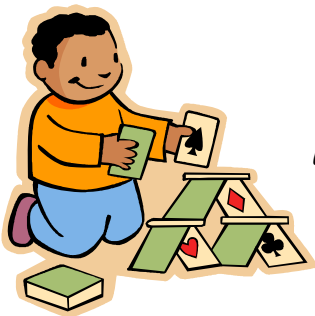
Play Inside & Make Crafts